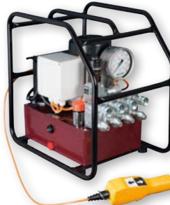
EXE MAX Super

2 port versions available for EXE MAX and EXE MAX Super