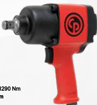
CP6773 1" 6151590410