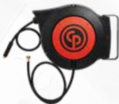
HR 8110 & HR 8210