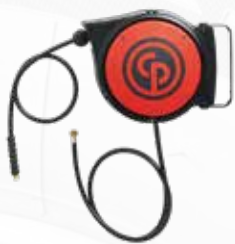
HR8108 & HR8208