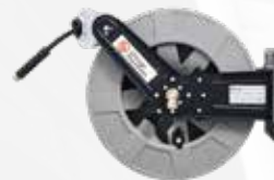
HR 9110 & HR 9113