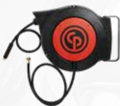
HR 8110 & HR 8210