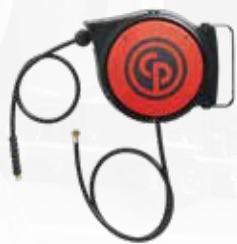
HR8108 & HR8208