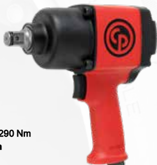
CP6773 | 1" 6151590410