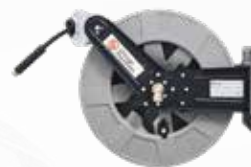
HR 9110 & HR 9113